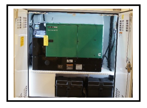
12 kW Onboard Remote Start