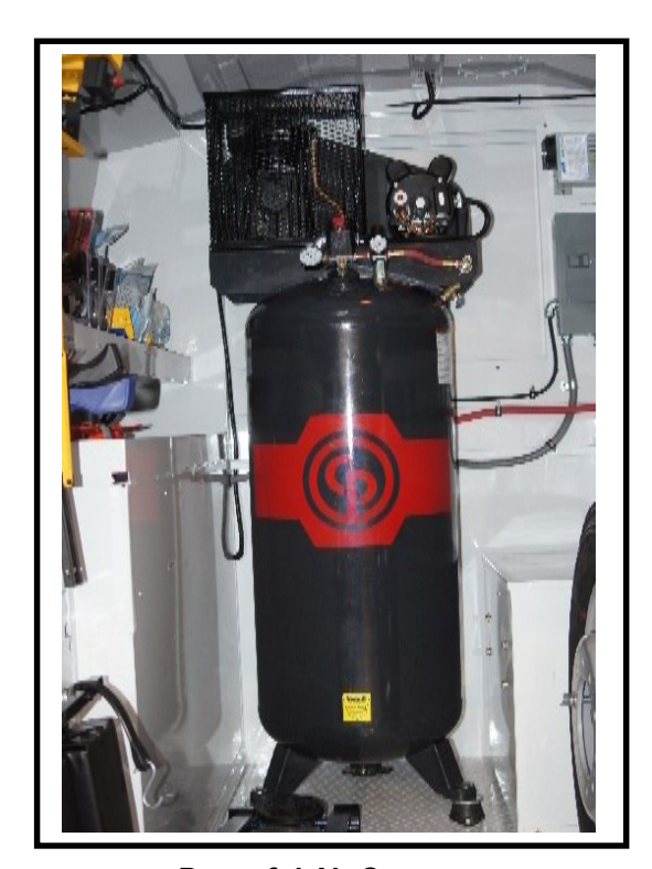
Powerful Air Compressor