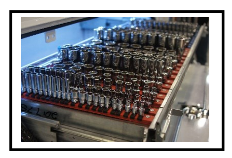
Automotive Tools in Easy Access Drawers

Quick and Easy Access to Heavier, Bulkier Equipment.