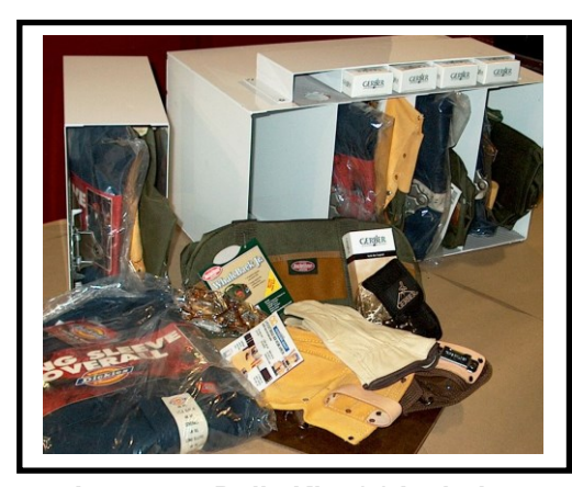
Inspector Daily Kits (5) Includes Toolbelt, Tool Bag, Gloves, Overalls, Glasses, Clipboard, and Multi-tool