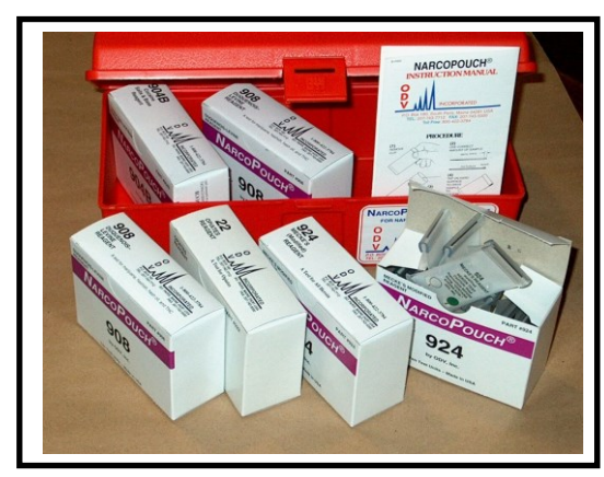
Narcotics Identification Kit