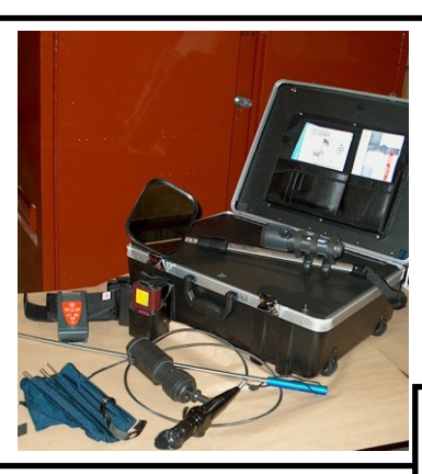
CT-30 kit includes Buster, Lighted Fiber-scope, Radiation Pager, and Probes

Tool Inventory Control Center and Documentation