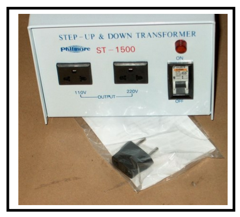
Power Transformer and Adapter