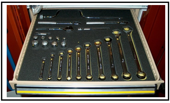
'Easy to Find' Hand Tools Shadowed in Drawer