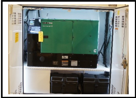
12 kW Onboard Remote Start