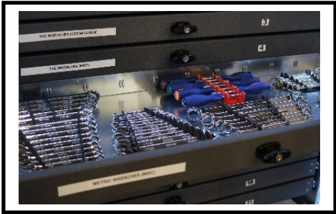
Automotive Tools in Easy Access Drawers