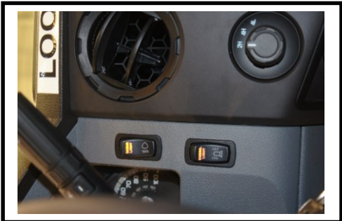
Fully integrated scene lighting and alarm systems; Dual fuel tanks and alternators plus backup battery,