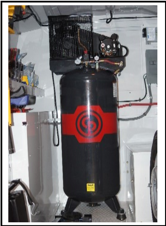
Powerful Air Compressor