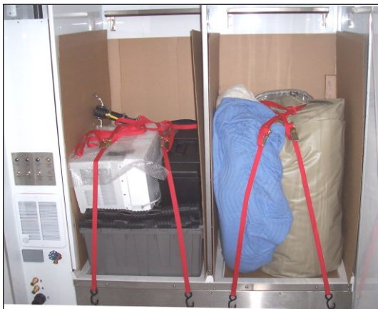
Packed Out Configuration