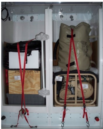
Packed Out Configuration