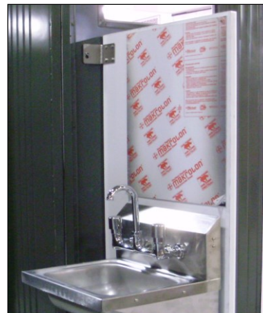
Included Shave/Wash Stand